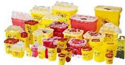
Sharps Container 23L Red or Yellow