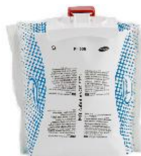
Sept Des Foam Soap 6packs x 600ml