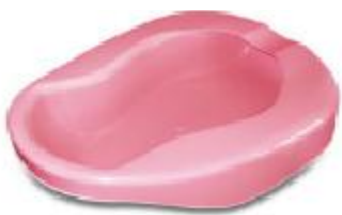
Plastic Bedpan pink