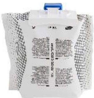
Sept Liquid Sensitive- 6packs x 700ml