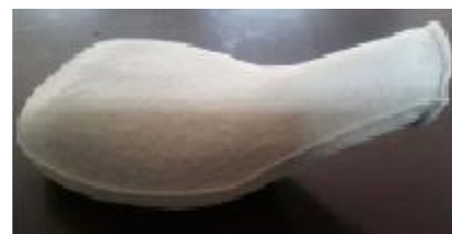
Paper Male Urinal