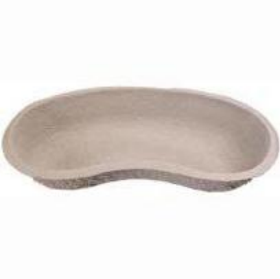
Paper Kidney Tray