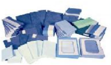
Universal Packs, Lap and Gown packs