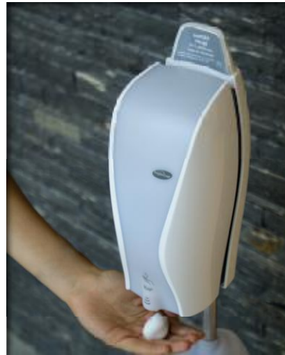
Sense or Touch Disinfection Dispenser Wall mounted / On stand